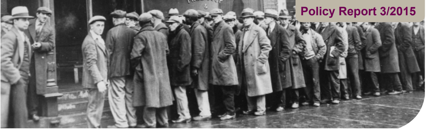
Image by unknown author (U.S. National Archives and Records Administration)