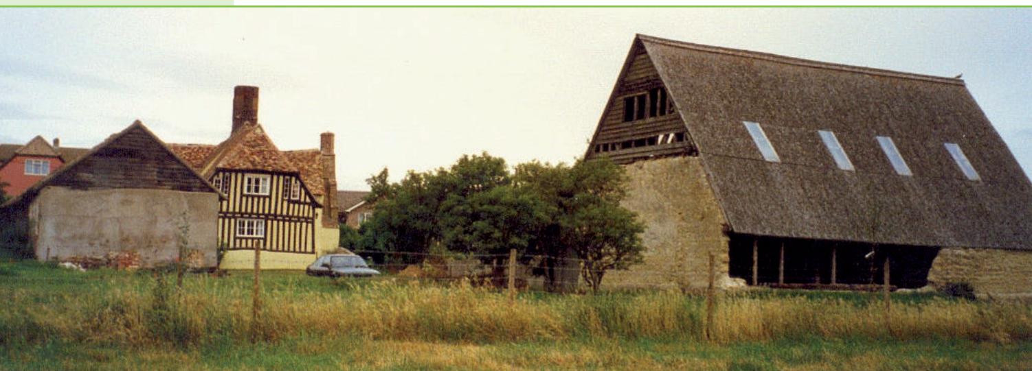
Bacons Manor with the derelict barn after the gale of 1987.