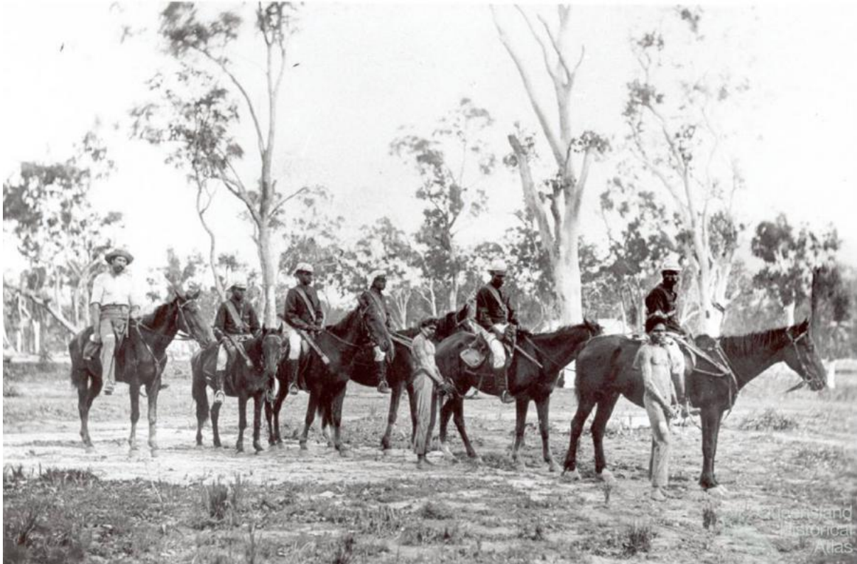
Image 2-North Queensland Native Police Troopers Escorting Indigenous Murderers, 1899, (oaj:ehive.com:objects/553888PM0938).

This phenomenon (Image. 2) is emblematic of a prevailing lack of trust between officers and troopers. The reality of this fear is affirmed by the published account of a former officer who claims to 'have known instances where their own men have shot at them from behind.' 61 In a retrospective history of the QNP, it was claimed that this practice was not motivated by fear of treachery, but rather to provide the trackers with an unobstructed view of the terrain. 62 It is interesting to note this extract features in a rather flattering account of the native police, appearing as late as 1964. Its appearance over fifty years since the force's operations ceased, accentuates how deeply embedded justifications were. Despite prominent concerns pertaining to the unreliability of troopers, there were conflicting reports of rigid discipline among the force. Writer Julian Tenison-Woods, following a day spent with a division of native police under sub-inspector Carr describes the compliance of the troopers, assuring that 'not a word' was uttered 'as they obeyed the orders of their