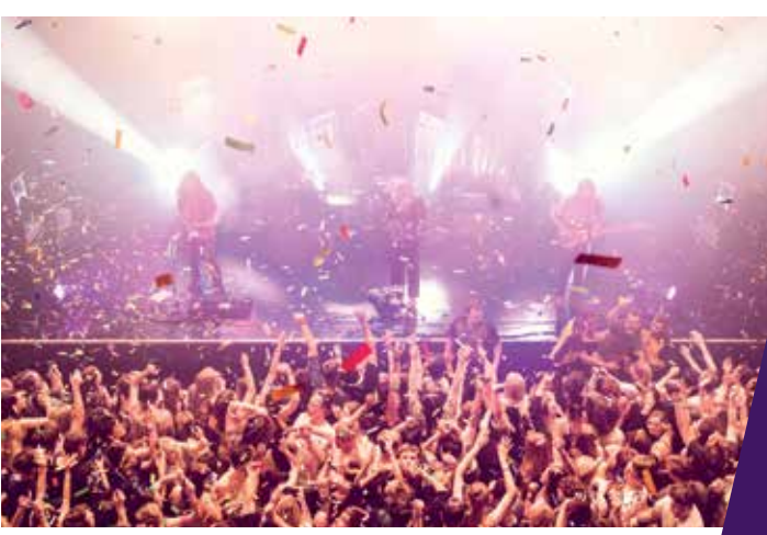
Enjoy Bristol's vibrant music scene, with diverse venues from converted cargo ships to world-class concert halls