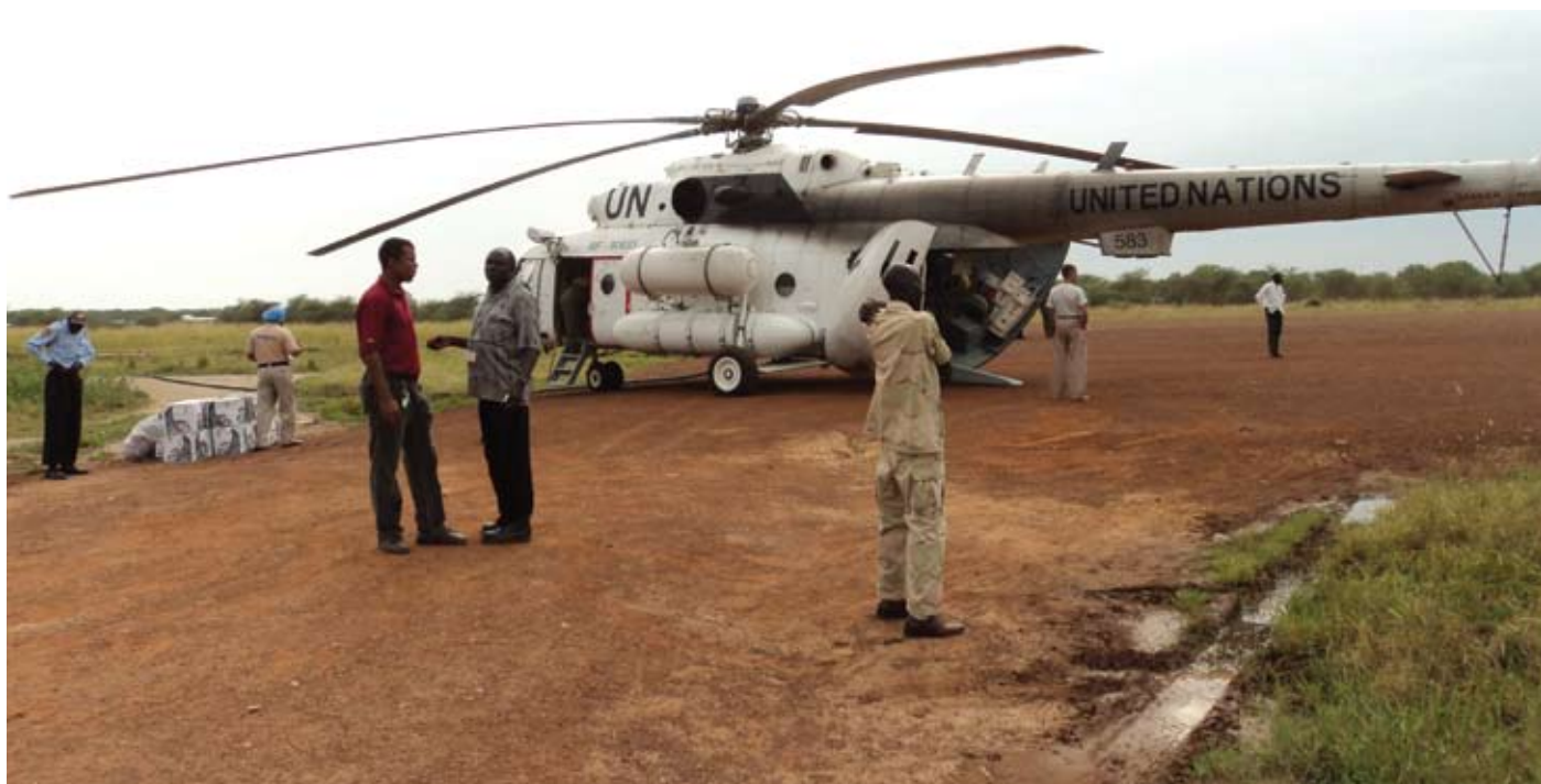
UN cargo flight, Bor, South Sudan