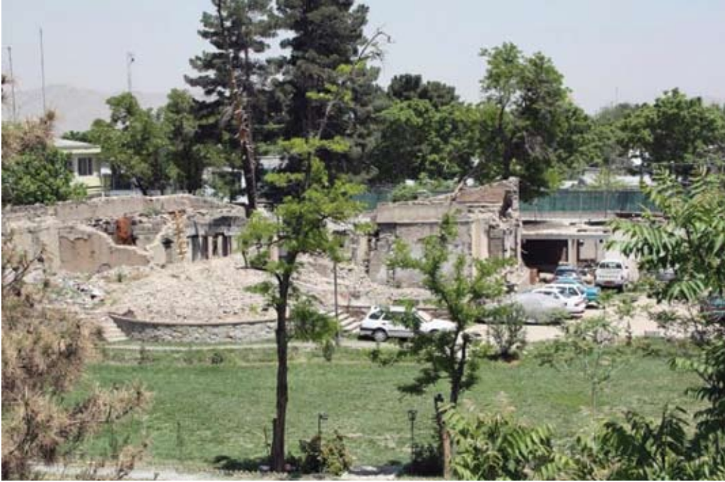
Ruins of CARE compound, Kabul, Afghanistan

for an NGO's security, commented that long-term residents can become complacent: 'It's a bit of a bell curve. The most inexperienced people are the ones who say "God will save me". And then there are the ones who have been here so long that they think they are invincible – myself included. I am on one side of the bell curve. I feel too complacent and confident'. Crucially, individual assessments of risks and their acceptability relative to the importance or 'criticality' of the mission or operation are heavily influenced by the (often poor) quality of knowledge and information about the risk environment. No calculated decision about acceptable risk exposure can ever be made if the individual or agency concerned has little or no understanding or information about the risks that they face in a given situation.