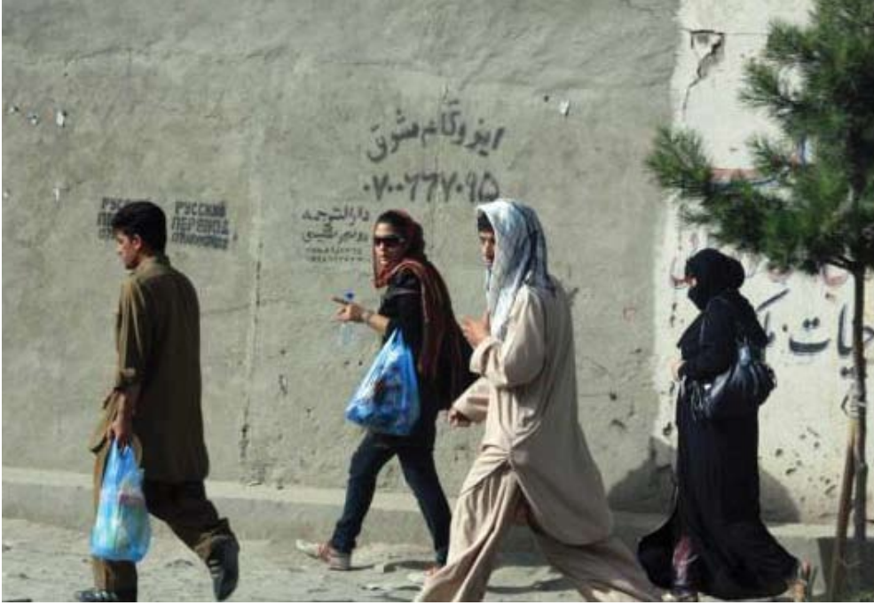
Expatriates shopping, Kabul, Afghanistan