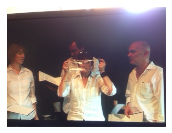
Theatr Iolo in opening scene of drama 'Ready or Not?'