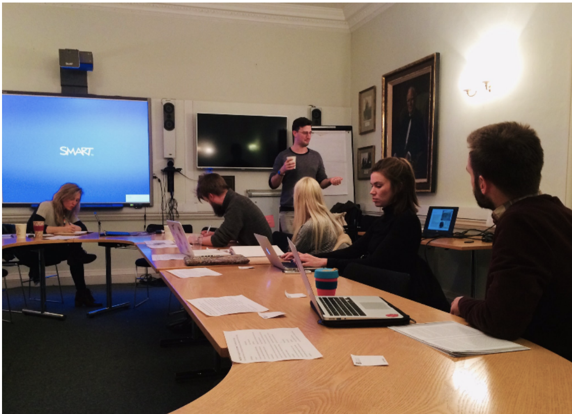
Last year's workshop on 'Teaching Warfare in the Ancient World'