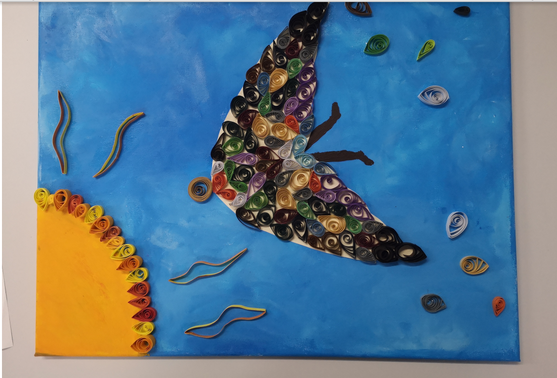
Ovid in the West Country finalist from Cardiff High School