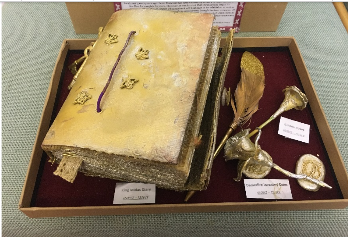
The winning entry from a Y7 student at Newent Community School