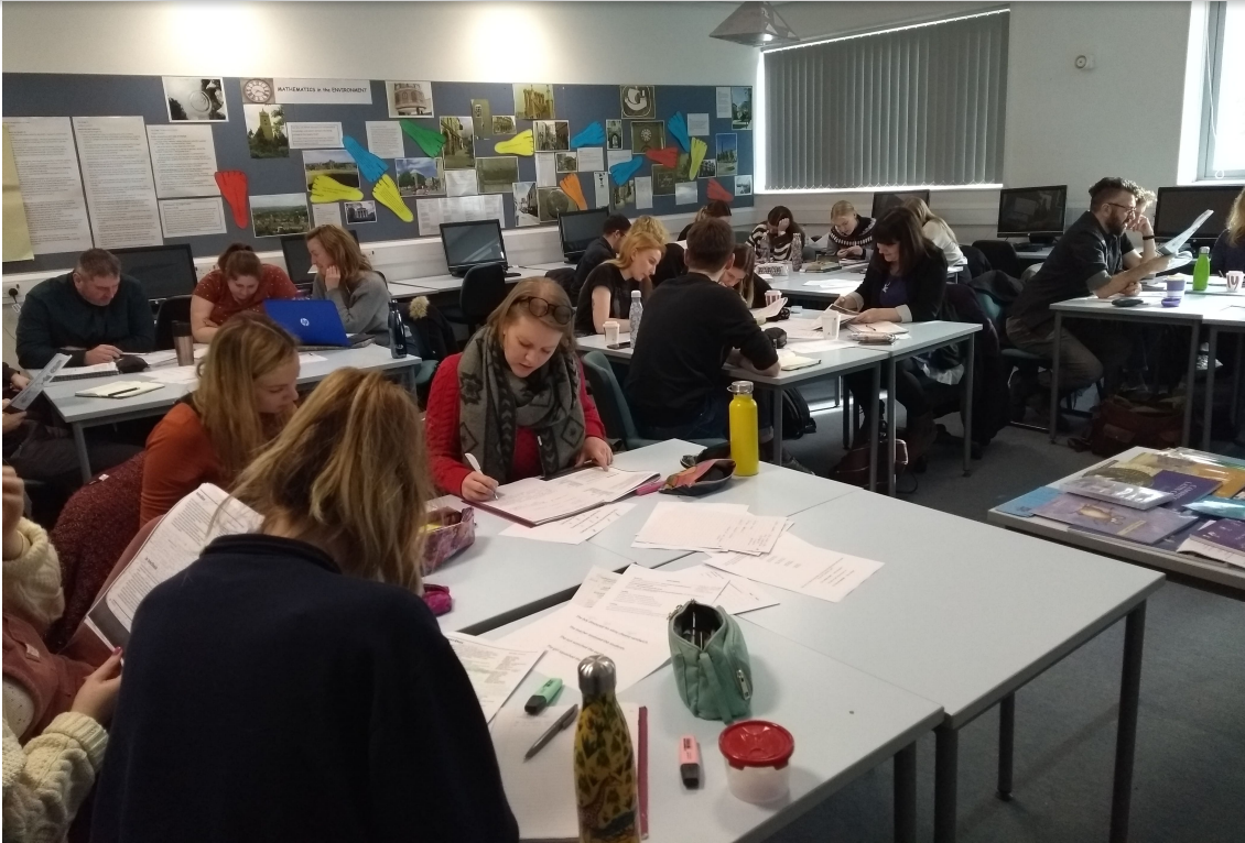
PGCE trainees during a previous Latin Day at UWE