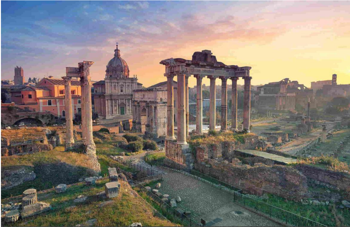
The Roman Forum is brought to life by Ancient Rome Live