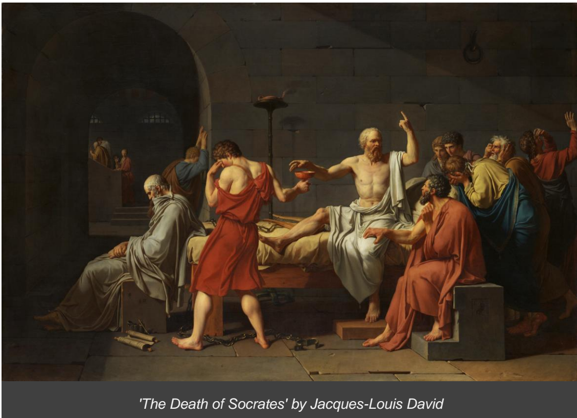
'The Death of Socrates' by Jacques-Louis David