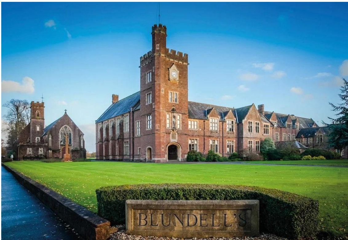
The ARLT Summer School 2021 was held at Blundell's School in Tiverton