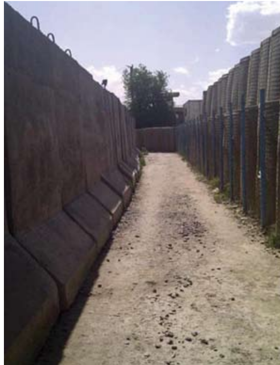
UNOCHA visitors walkway, Kabul, Afghanistan

This report seeks to address this gap. 1 Drawing on fieldwork in South Sudan and Afghanistan between late 2010 and early 2012, it documents some of the challenges that aid workers and their organisations face in these difficult contexts, and explores the implications for programming. What aid actors tell themselves and others that they are or should be doing and what they are actually doing are often quite different things. Our findings challenge much of the received wisdom and assumptions that underpin the current mainstream discourse and guidance on risk and security management across the sector, including the presumption that aid workers and agencies are likely to act and behave in rational, predictable and principled ways in these difficult environments. In reality, and as the history of the aid encounter shows in countries such as Afghanistan and South Sudan, operating in conditions of chronic insecurity is a messy, uncertain and compromising business. Because it is so focused on the immediate practicalities of trying to stay physically safe while keeping