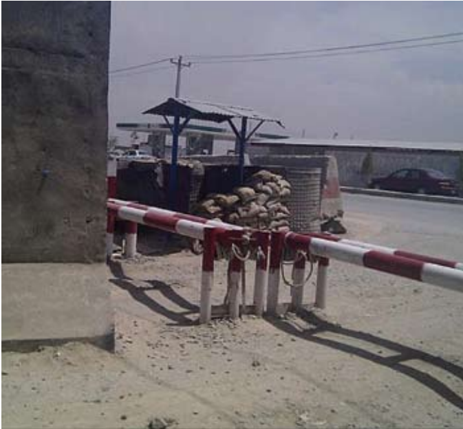
UNOCA gate, Kabul, Afghanistan