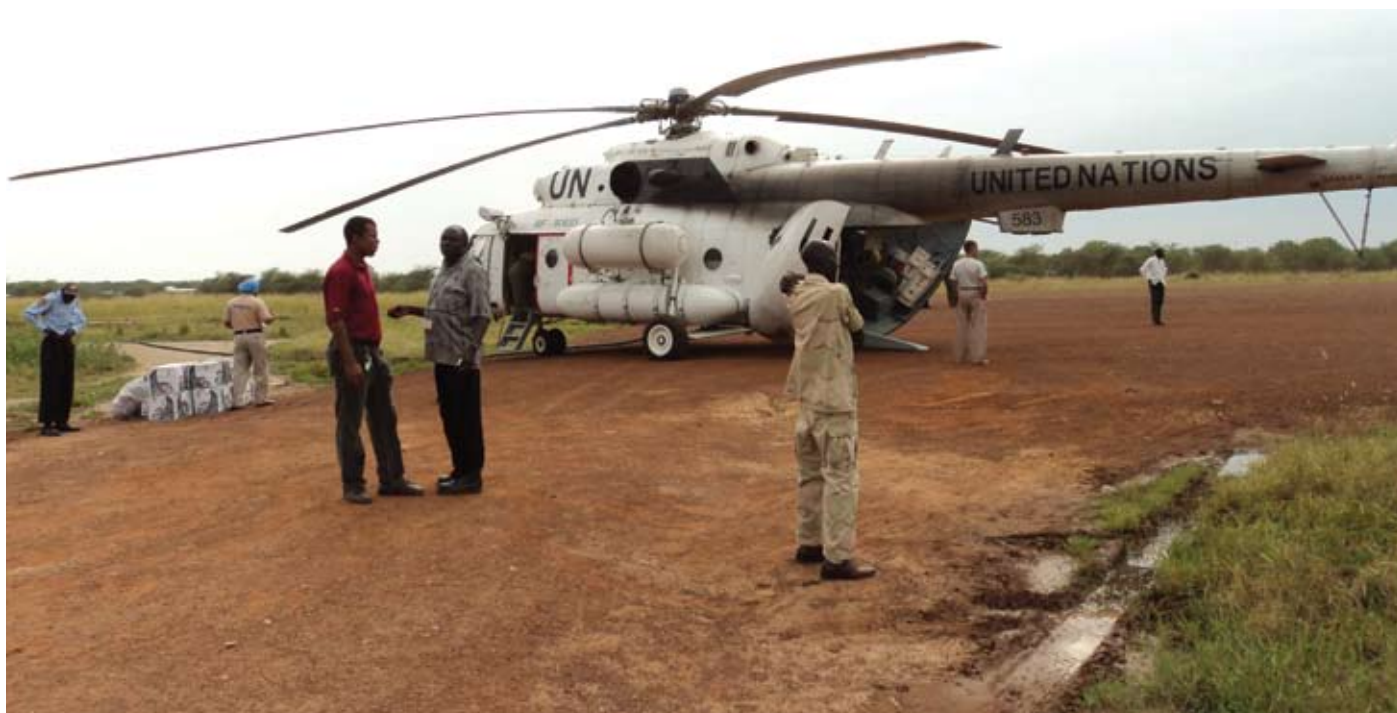
UN cargo flight, Bor, South Sudan