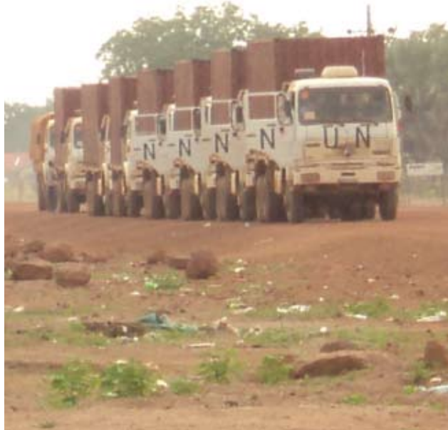
UN convoy, Rumbeck, South Sudan