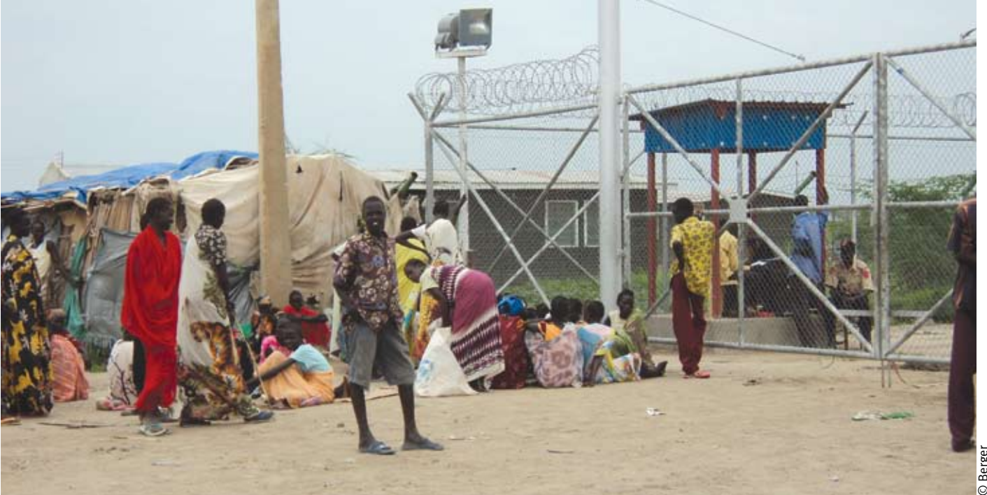
Queuing outside WFP compound, Bentiu, South Sudan

colleagues' (or partners') information and analysis, consulted them as co-equals ... and often had nationals in senior leadership or analytical positions in the security area' (Egeland et al., 2011: 45–46). In Afghanistan, this research found that the views and perspectives of local Afghan NGO workers often differed substantially from their international colleagues, with a focus on the local context and their own lives and priorities rather than on broader organisational objectives.