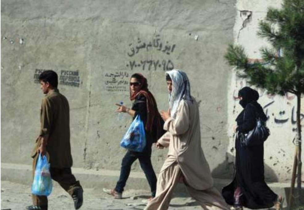
Expatriates shopping, Kabul, Afghanistan