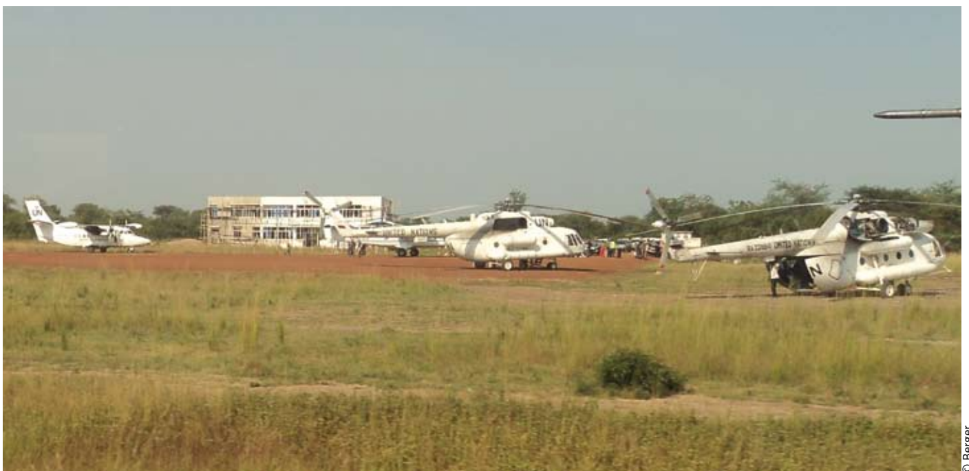
UN and WFP aircraft, Bor airstrip, South Sudan