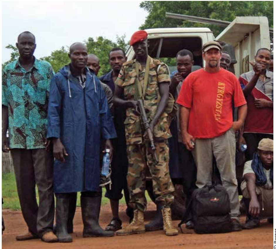
US defence subcontractor convoy, Rumbeck, South Sudan

This has created powerful incentives for aid agencies to be present and operational in chronically insecure countries. During the 1990s, when the Taliban held power in Afghanistan, the UN mission would withdraw on the slightest provocation, including in one instance the throwing of a coffee pot at a UN official (Donini, 2009: 8, fn. 14); today, even the deaths of aid workers are met with a defiant resolve to remain (BBC, 2011). Where donor governments and the UN are engaged and determined to stay, so too are the many international NGOs and consultants that subcontract for them. Those 'fragile states' deemed important to Western security are also the aid industry's most profitable areas, and where the contract culture is most active. While aid agencies like to see their presence as a reflection of programmatic or humanitarian 'criticality', it is also true that, to maintain market share, they have little choice but to follow the money (Van Brabant, 2010: 10). For international NGOs, not having a visible presence in challenging environments threatens brand loyalty, weakens