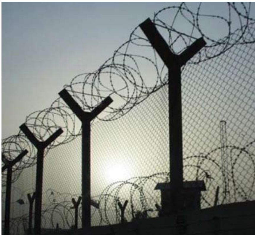
Perimeter fence, Kabul, Afghanistan

from around 50 to 155 registered agencies by 2010, along with a similar number of national NGOs. 4 Organisations are engaged in activities ranging from recovery and reconstruction to political stabilisation, peace-building, state-building, humanitarian relief and development, with donors encouraging the integration of aid and political activities to create ‘comprehensive’ or ‘integrated’ approaches.