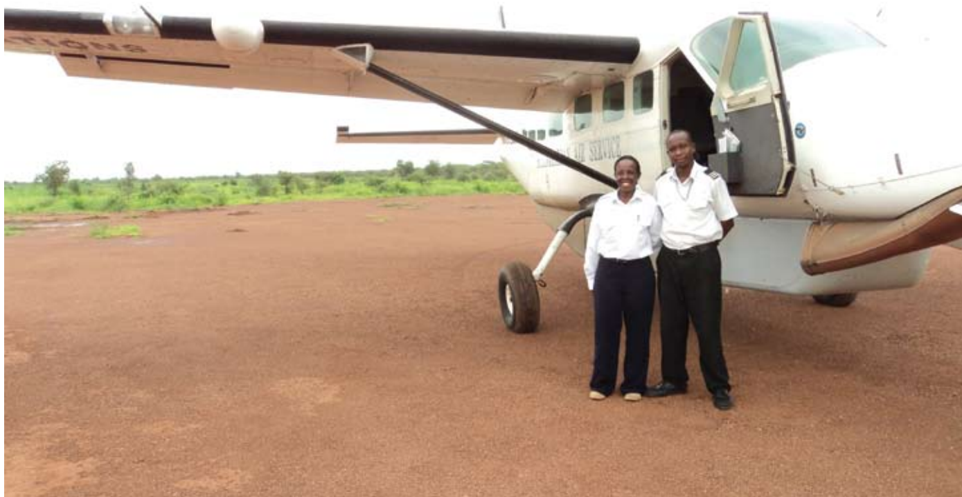
Kenyan WFP pilots, Bentiu, South Sudan

as giving them an insider's view of local power dynamics; equally, though, it can easily translate into fears of bias and susceptibility to community pressure. Many agencies also rely on security-related information and 'intelligence'. This stream of security data and alerts can clutter, obscure and complicate analysis of complex security environments. While the level of detail contained in security reports does not necessarily correlate with increased accuracy in prediction, it does serve to reinforce the perception of a constant and active threat, potentially fuelling paranoia or, conversely, desensitising the target audience to real threats.