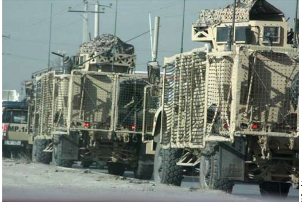
ISAF vehicles, Kabul, Afghanistan

Despite the real or perceived increase in the dangers involved, there has been an unprecedented expansion into these contexts at every level, in terms of geographical reach, funding availability, agencies involved and the range and complexity of their responsibilities. This has been driven by a new and unprecedented form of international political and military patronage of the sector, with the drive towards integrated missions, international stabilisation and the 'war on terror' producing vast and highly politicised and militarised flows of international aid into unstable environments such as Afghanistan. Given the significant amounts of money involved, many agencies – especially those involved in state- and peacebuilding – have been willing to work under this more partisan umbrella, while others have sought to emphasise distance and independence. There has also been an expansion in private and for-profit security companies and consulting organisations working in challenging environments. These new actors have added to the feeling of fragmentation and competition within the aid sector. The turn towards remote management as a risk-transfer strategy among more established agencies has added to this fragmentation, with a proliferation of partnership and subcontracting arrangements involving an increasing reliance on national aid workers and local NGOs. For international NGOs, private contractors and consultants, not to be 'present' in today's challenging