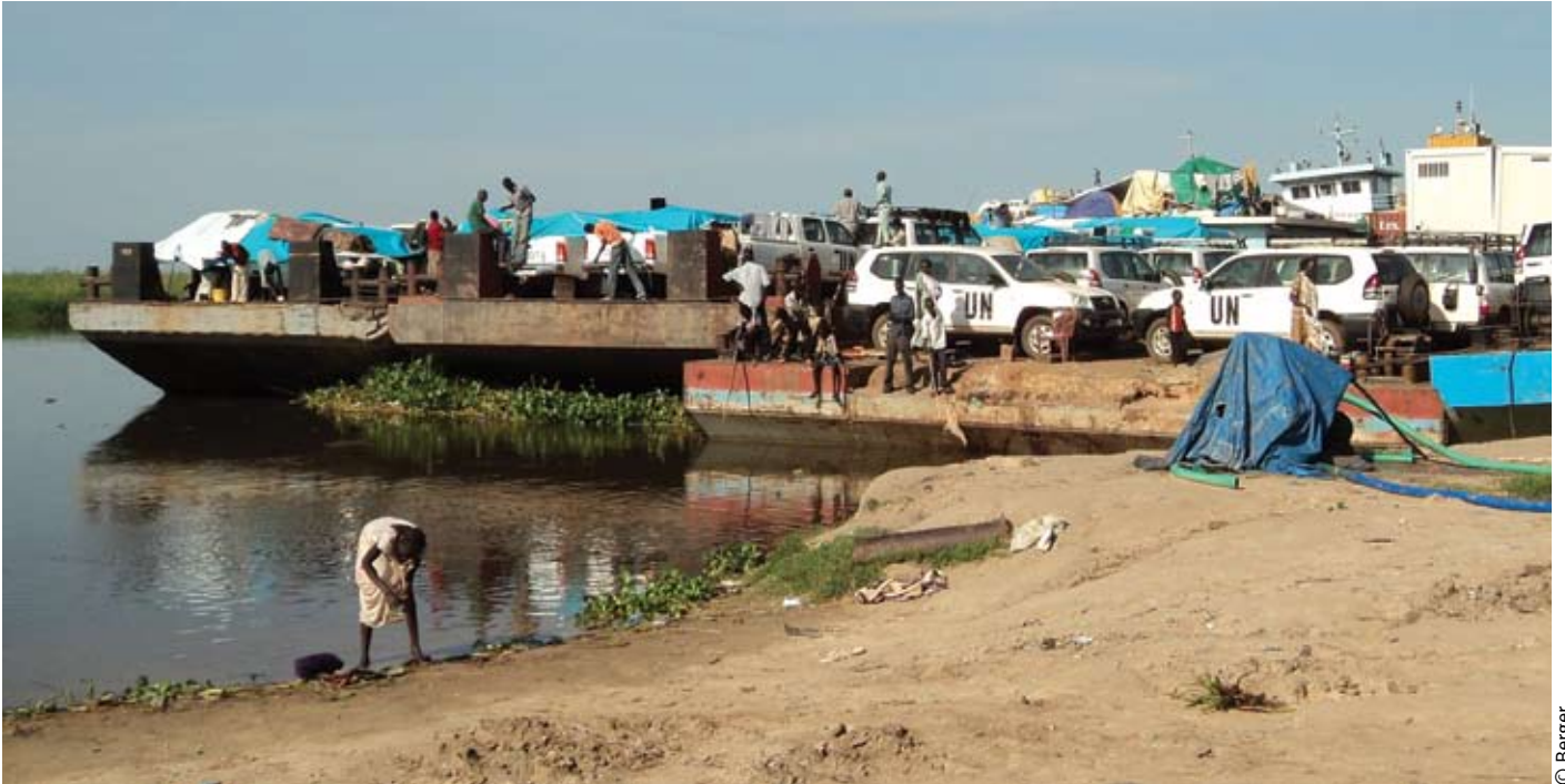
UN vehicles en-route from Khartoum to Juba, Bor, South Sudan