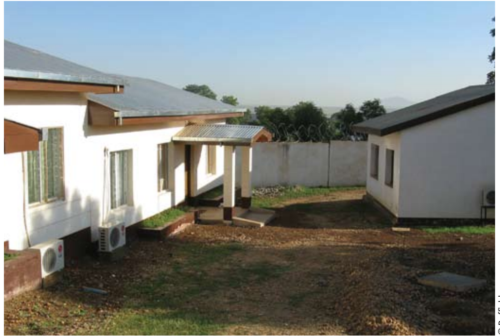
UNHCR residential compound, Juba, South Sudan

There is a well-rehearsed and well-recognised critique that aid agencies are weak on contextual understanding and analysis to support their programming in conflict-affected countries and complex humanitarian emergencies. While good situational knowledge and information would be considered a prerequisite for aid programming in any context, it is seen as all the more critical in volatile and risky political and security situations where the complexities of engagement and the consequences of flawed interventions are significantly heightened (see Collinson et al., 2002). Despite the aid sector’s growing expansion and