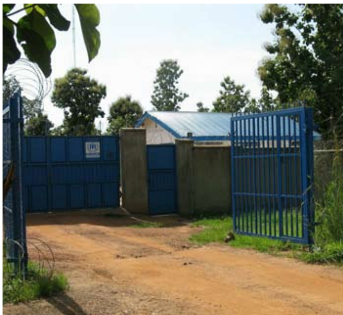
UNHCR compound, Yei, South Sudan

bridge this gap in a number of ways, such as ensuring a presence at distribution points, signing public agreements with communities or arranging alternative sites where communities and expatriates can interact directly; some are looking at technical solutions using satellites, mobile phones and GPS tracking. But with operational aid activities increasingly subcontracted or outsourced, the level of responsibility and accountability for outcomes becomes increasingly unclear; as put by a contractor interviewed for this study, as soon as a task has been subcontracted, the outcome is no longer their responsibility. 21 If a contractor or implementing partner does not have any responsibility in relation to the overall objective or the outcomes of their particular project, implementation will most likely come to reflect this. By withdrawing from the point of implementation, liability for negative outcomes can be avoided by claiming ignorance: reference to the security risks and obstacles involved in monitoring outcomes provides an alibi for not knowing; meanwhile, any vested interests in the status quo may seek to exaggerate the scale of the danger.