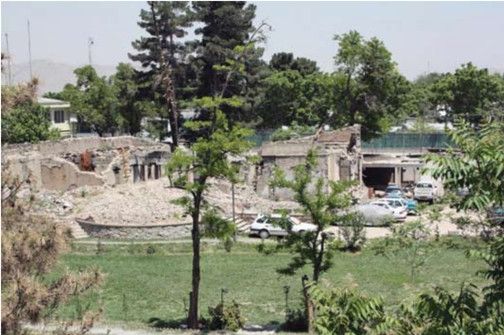
Ruins of CARE compound, Kabul, Afghanistan

for an NGO's security, commented that long-term residents can become complacent: 'It's a bit of a bell curve. The most inexperienced people are the ones who say "God will save me". And then there are the ones who have been here so long that they think they are invincible – myself included. I am on one side of the bell curve. I feel too complacent and confident'. Crucially, individual assessments of risks and their acceptability relative to the importance or 'criticality' of the mission or operation are heavily influenced by the (often poor) quality of knowledge and information about the risk environment. No calculated decision about acceptable risk exposure can ever be made if the individual or agency concerned has little or no understanding or information about the risks that they face in a given situation.