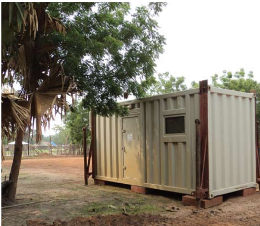
US State Department 'Safe Haven', Rumbeck, South Sudan

The research encompassed conversations, interviews 2 and participant observation with a broad range of actors connected in different ways with the aid sector: representatives of donor governments, UN agencies, secular and religious INGOs and national and local NGOs, civilian subcontractors and security firms, local service providers, peacekeepers, journalists, private consultants, political and security advisers, UN pilots and a cross-section of local people from communities receiving aid. 3 The research was conducted entirely independently and without the direct support of any international organisations. The research on host populations' perceptions of the aid industry was conducted in partnership with two local research institutions – in Afghanistan with the Peace Training and Research Organisation (PTRO), and in South Sudan with Small and Medium Entrepreneurship Capacity Building Consult, South Sudan (SMECOSS).