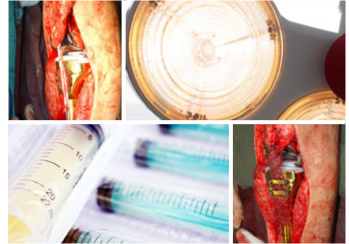
Top left and bottom right: A new approach to attach tendons to metal prostheses

An important additional aspect to the use of this facility is for research and development related to surgical techniques, devices and implants. The fresh frozen cadaveric material we have available at the centre is ideal for surgeons and research staff to develop and trial these new advancements to ensure the pre-clinical design feasibility, efficacy and safety of procedures in the operating theatre.