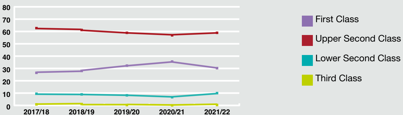
% Classifications over time (Level 6)